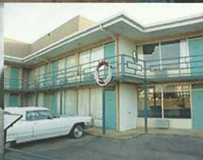
The Lorraine Motel