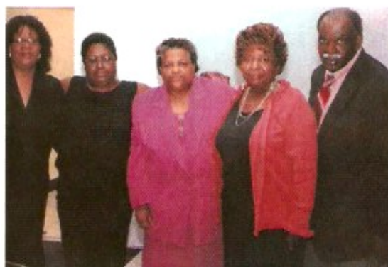
Alumni from the class of '70