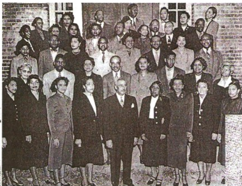
PHS Faculty 1951